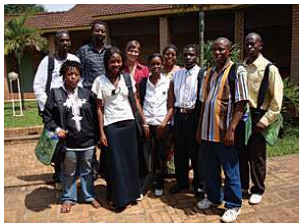
After completion of the GIS training for secondary school teachers in 2007, teachers such as these pictured developed ways of applying GIS in their classrooms.

In a first phase of the project, 10 schools and 30 teachers were trained and prepared for teaching with GIS tools. The schools and teachers were selected according to different criteria, such as number of working computers, experience in teaching IT, and stable electricity. The public, private, and religious schools with French and/or English instruction are distributed all over the country and serve as training centers for subsequent schools in their neighborhoods. They are currently teaching GIS to about 500 students and evaluating GIS as a didactic medium to explore, investigate, and illustrate common curriculum contents. Because there is no official curriculum, the teachers offer GIS lessons on a